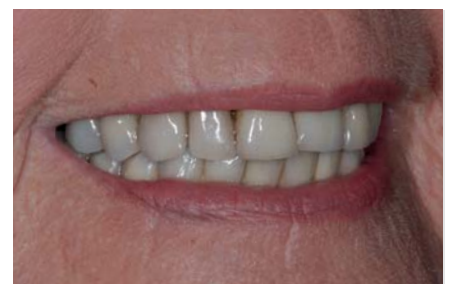
18. After final adjustments and closure of screw access holes, the patient is satisfied with esthetics and function of the new fixed Atlantis suprastructures.