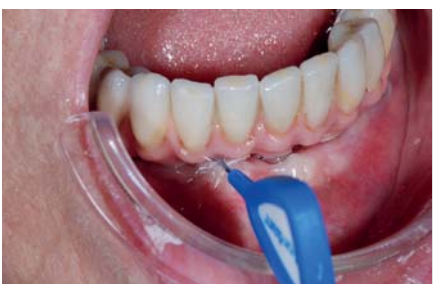
16. Optimal conditions for cleaning and maintenance. Approximal brushes are tried out to ensure accessibility.