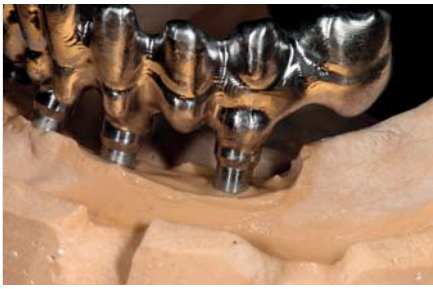
7. The dental laboratory receives a tension-free implant suprastructure in cobalt-chrome with optimal surface treatment. This eliminates the need for further grinding before porcelain build-up.