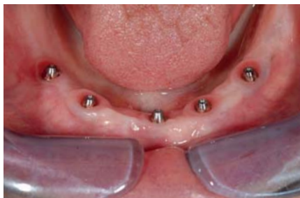
14. UniAbutments and a healthy soft tissue. Due to optimal healing caps, the abutments are nicely exposed which allows for easy inspection and verification of the fit of the implant suprastructure.