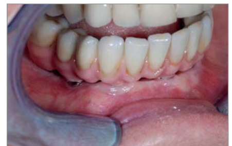
15. The final Atlantis suprastructures in place. Passive fit was verified, and the patient is satisfied with the final outcome.