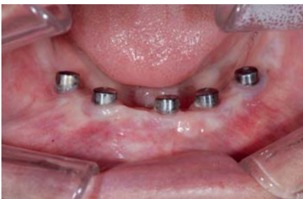
13. After healing, the clinical situation shows a healthy soft tissue around the healing caps. Relatively wide caps are used to facilitate optimal clinical conditions for the final implant suprastructure.