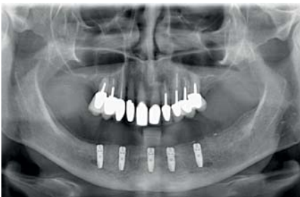
1. Five OsseoSpeed TX implants were installed in the lower edentulous jaw, in a two-stage surgical procedure. The alveolar crest was uniform and wide enough anterior to the mental foramen to allow ideal positioning of the implants.