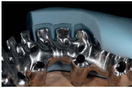
8. The dental laboratory silicone key is placed on the master model to verify sufficient cut-back space for optimal porcelain build-up.