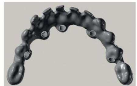
6. The Atlantis Bridge is milled only after review and final approval of the CAD design, in Atlantis Viewer.