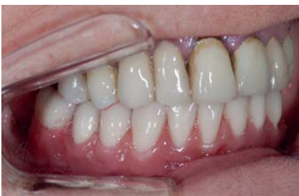
4. Try-in of final teeth set-up in wax. The occlusion and articulation were checked and verified before the implant suprastructure was finalized in the dental laboratory.