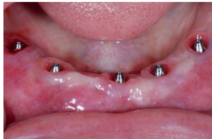
2. Ten weeks after implant installation, healing abutments were removed, and UniAbutments were placed into the implants.