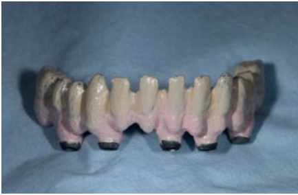
10. The opaquer is applied to outline the crowns and soft-tissue design in order to create the correct core shade for proper background when firing porcelain.