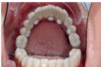
17. Screw access channels are temporarily closed (e.g. Cavit, 3M ESPE). The dental arch is positioned slightly anterior to the alveolar crest to compensate for atrophy of alveolar bone and ensure a healthy occlusion. Patient's former facial vertical height, occlusion and articulation are restored.