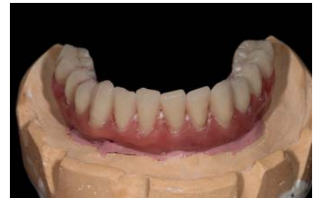
3. Teeth set-up on the master model. Three or more screws are tightened into the restoration to verify a stable fit of the implant suprastructure.