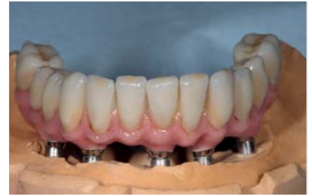
12. The soft tissue mask removed. Combining esthetics with functionality facilitates optimal cleaning around the abutments/implants.