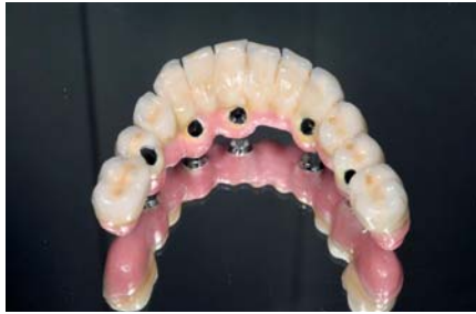
11. Final Atlantis Bridge in cobalt-chrome with porcelain layering technique (e.g. GC Initial MC).